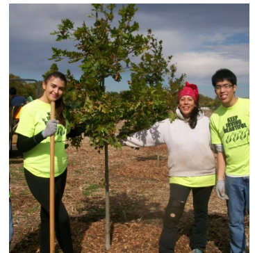
Service Learning students in action at the UPS tree planting at the Mountain Creek Preserve Tree Farm (above), and at the Irving Family YMCA Fall Festival (below).

Think before you throw an item into the trash: Can this be reused or recycled?