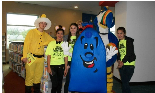
Service Learning students entertained guests by dressing as mascots and literary characters at the South Irving Library Grand Opening on March 21.

During the 2014-15 school year, North Lake students participated in: the Trash Bash and Trash-Off, as well as joining with other groups for cleanups, like the Nimitz FFA at Trinity View and the Irving Lake Association at the annual spring Lake Vilbig cleanup; planting trees at the city of Irving's Tree Farm; several paint projects at Irving parks; the Grand Opening of the new South Irving Library; and community events like the Irving Family YMCA Fall Festival, where they worked the KIB table and prize wheel and made it a green event by collecting recyclables and keeping the grounds litter-free. KIB tried to offer as many different and interesting opportunities as possible with a variety of partners to engage the students in meaningful volunteer community service.