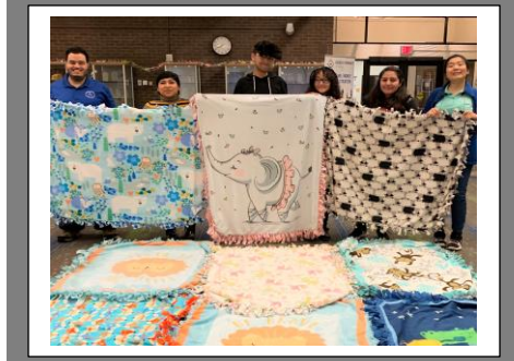
Top to Bottom: KIB will attend EarthX 2019 at Fair Park April 26-28; Don't Mess with Texas Trash-Off is scheduled for April 6 at Trinity View Park; Kirby with Otis Brown students at Career Day; North Lake SGA students with blankets they made.