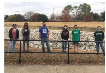
KIB's last project of 2020, painting at Running Bear Park