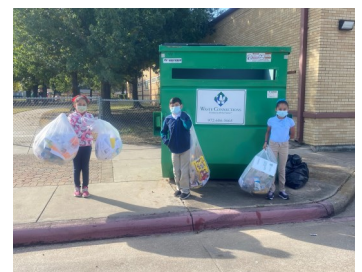
Brown Elementary students show how they recycled for America Recycles Day