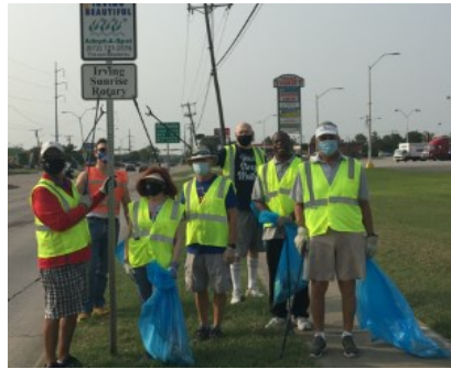
Sunrise Rotary at their Trash Bash cleanup

Irving-based Girl Scouts continued to be of service right to the end of the year. Troops 6458 and 3473 painted the metal safety handrails at Running Bear Park on Dec. 18, with six