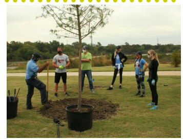
The Acosta Cares team planted trees at Bird's Fort Trail