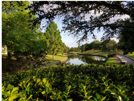
Clockwise from upper left: 1st Place - "Morning Bliss," 2nd Place - "Towne Lake Park" 3rd Place (tie) - "Ducks in a Row Following the Leader," "The Greenery of Irving in Spring"