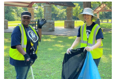
Nexstar employee volunteers at T.W. Richardson Grove Park

Save the date of September 25 for the 30th annual Trash Bash at T.W. Richardson Grove Park. Check the KIB website for registration information!