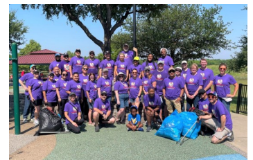
The Chuck E. Cheese Juneteenth event at Running Bear Park