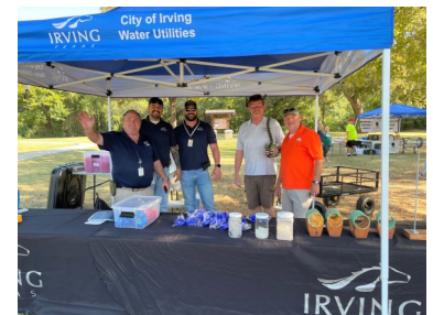
Water Utilities team provided water conservation education.