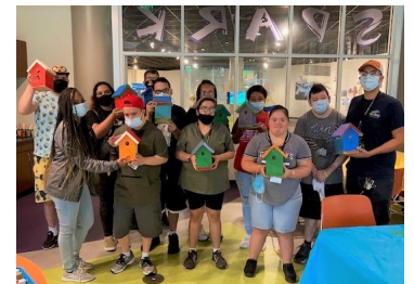
Adult Day Therapeutic Program members with their birdhouses