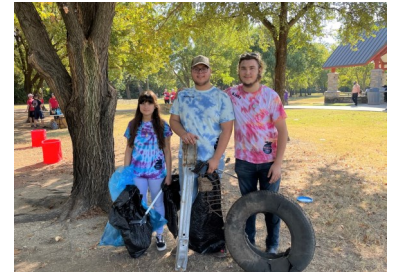
Nimitz FFA students found interesting items at the Trash Bash

Our Fall Photo Contest opens on Oct. 1. KIB is looking for photos that show the beauty of Irving. We were so impressed with the quality of photos from past contests, and are looking forward to more. Details are on the Facebook Event page.