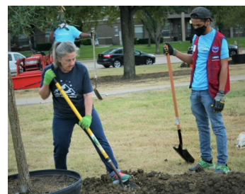
Mission Tomorrow "Trees for Life" at Cimarron Park in October