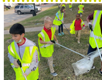
Senter Park after-school program members at their cleanup