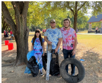
Nimitz High School Students at the Trash Bash

KIB is always seeking new projects and ways our volunteers can be of service. This year we launched a Holiday Card Campaign, asking people to write cards or notes to be given to local nursing home residents to bring a little Christmas cheer. With a goal of 140 cards, we were overwhelmed with the kindness shown by the Irving community, who brought 535 cards to the KIB office! It was wonderful delivering those, and look for an announcement soon about a similar project for Valentine's Day.