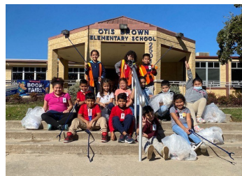
Brown Elementary students show how they recycled for America Recycles Day