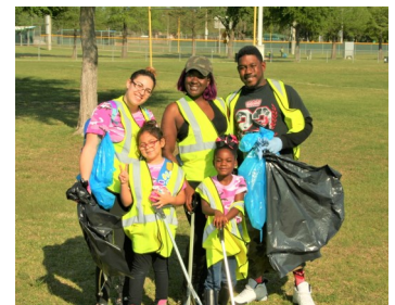
Register online through March 25 for the Don't Mess with Texas Trash-Off.