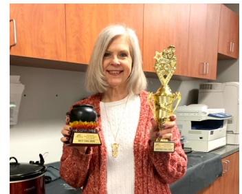
KIB took first place in the annual Parks and Rec Chili Cook-Off.