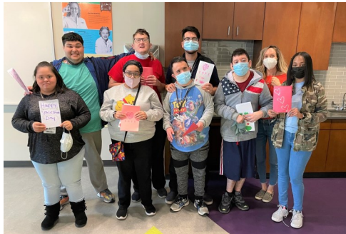
Adult Day Therapeutic Program clients display the Valentine's Day Cards they made.

March will be full of activity for KIB as we roll into the spring season. Upcoming events include a tree planting with Abbott Laboratories employee volunteers, a craft project with our friends from the Adult Day Therapeutic Program, a Mardi Gras celebration at the Heritage Senior Center, and two cleanups at the Rock Island Road Bike and Pedestrian Trail—one with local Girl Scouts to commemorate the Girls Scouts of America's 110th birthday, and one with the KIB Board members. We will also have the honor of attending a luncheon to recognize two outstanding KIB volunteers who