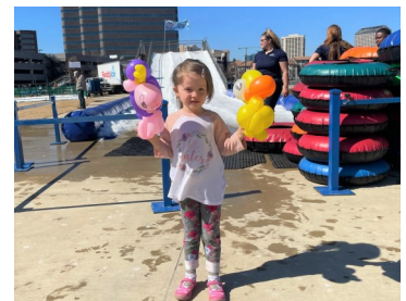
Visitors enjoyed snow hills, balloon animals and much more at Frost Fest