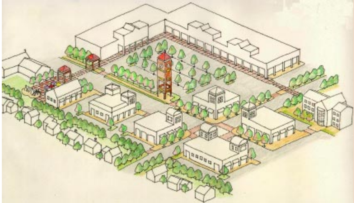
Neighborhood Center concept at Shady Grove and Story Roads showing neighborhood-oriented redevelopment with bicycle/pedestrian connections, landscaping, and distinctive architectural features.