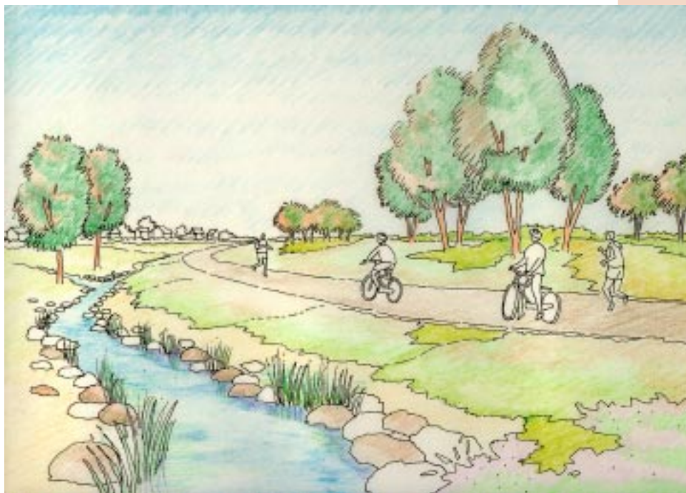
Stream Corridor Greenway. The greenway is developed with a continuous pedestrian/bicycle trail.