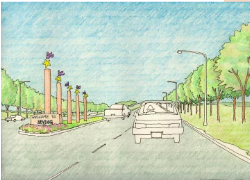
Secondary Entrance to Irving at Royal Lane. Signage, planting, and architectural elements announce entry to the City.