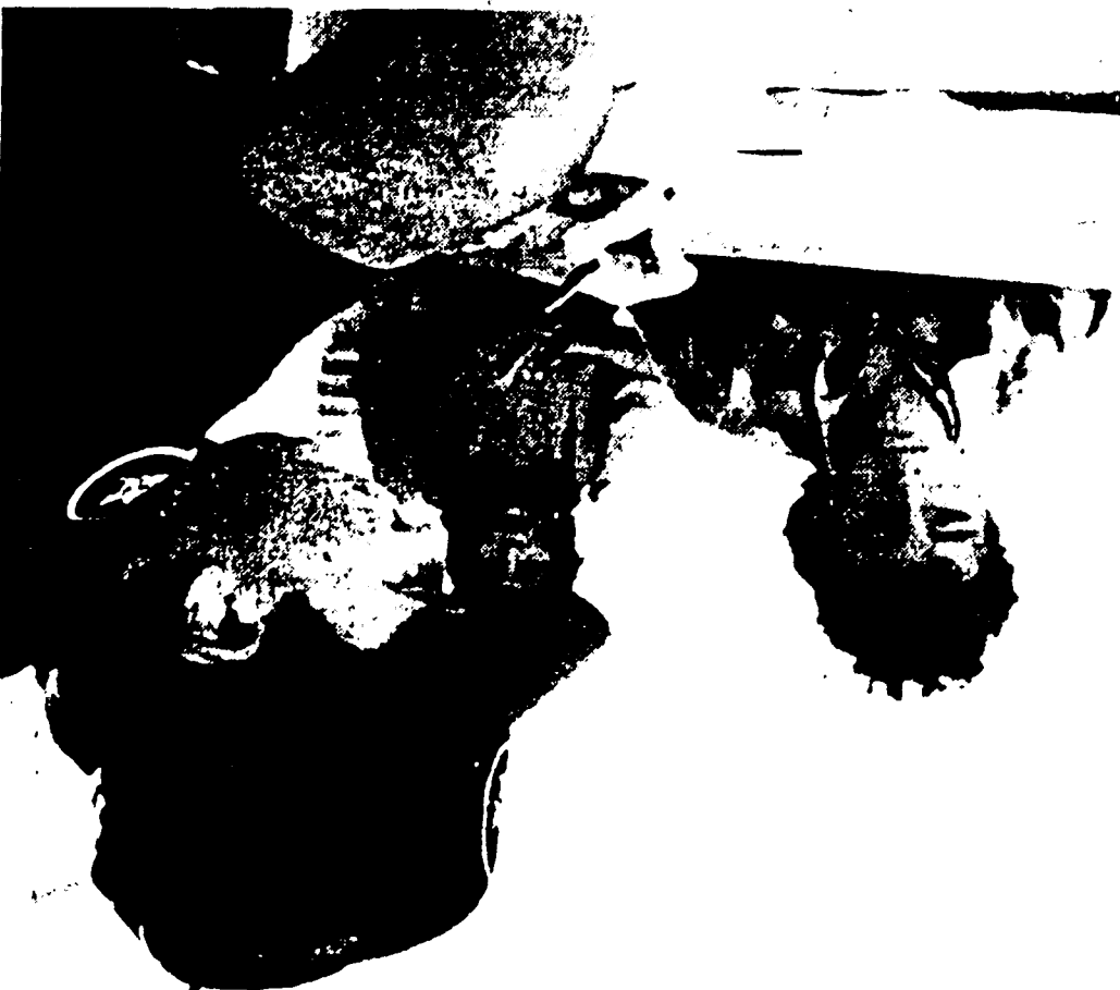
A border patrolman at the Kingsville border patrol office interviews a Salvadoran national who was involved in a train accident which killed four and injured eight illegal aliens.

The smugglers had not been apprehended, authorities said. Some of the aliens jumped off the trestle, which was about 30 feet above a small creek. It was unclear how many were struck by the train