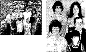
There are 29 photos in the gallery