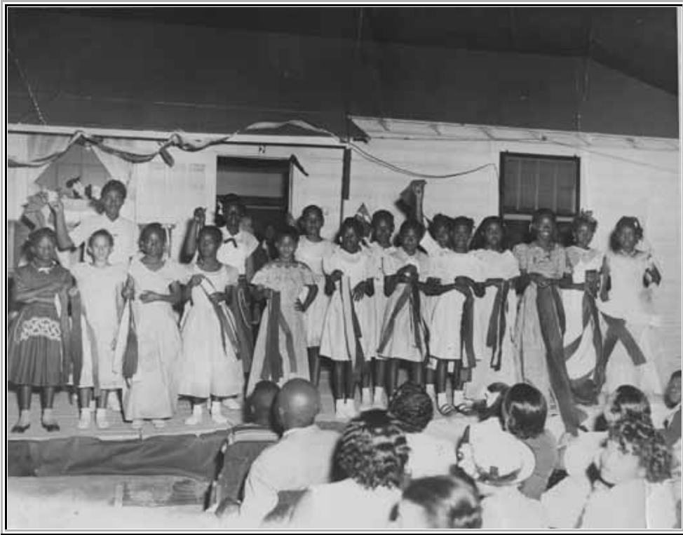
Graduation ceremonies , c. 1950